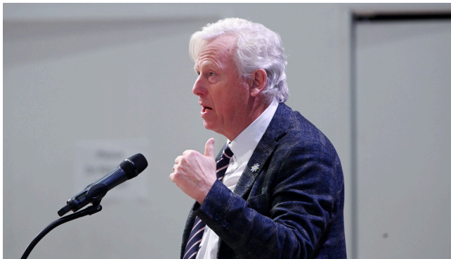
Former Mayor of Toronto David Miller delivers his keynote speech at CART showcase, Feb. 9, 2024.