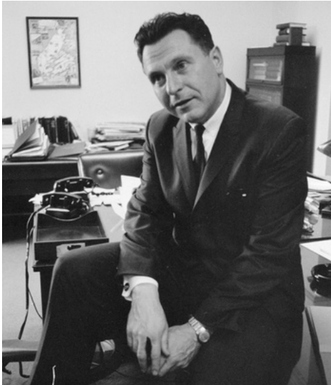
Allan J. MacEachen, 1963.

The MacEachen Institute for Public Policy and Governance at Dalhousie University is a nationally focused, non-partisan, interdisciplinary institute designed to support the development of progressive public policy and to encourage greater citizen engagement.